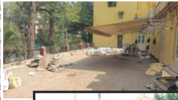
A newer outlook with a tile change