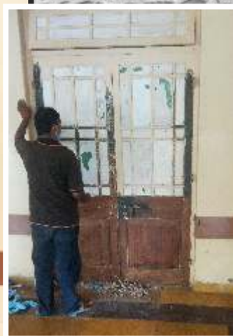
What lay beneath! - The hall doors get a polished look