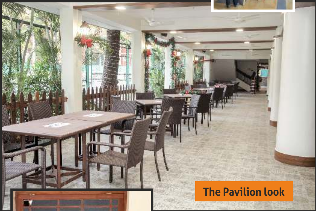
The Pavilion look