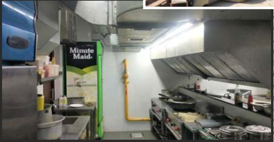
The new replaces the old. The kitchen refurbished