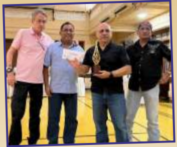
Tennis -Members' Doubles