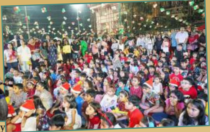
Children's Christmas Party